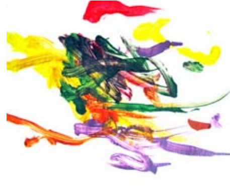
Aaron Cowie (AGE 5)